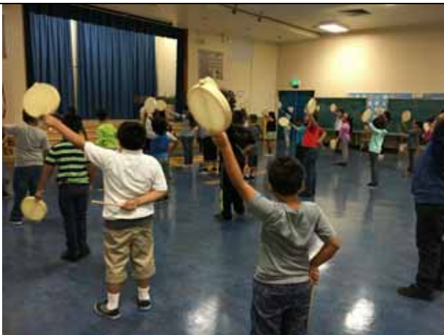
2016 Rhythm of Korea Showcase