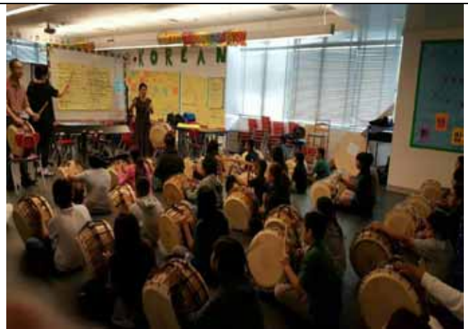
2016 Rhythm of Korea Showcase