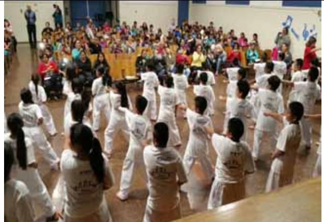
2016 Taekwondo Showcase