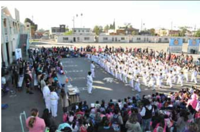
2016 Taekwondo Showcase