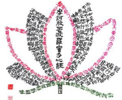
왕혜경 / 반야심경