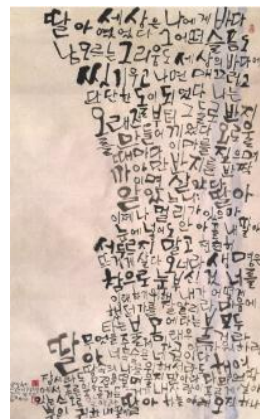
황은지 / 어머니의 편지