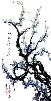
홍봉자 / 매화 II