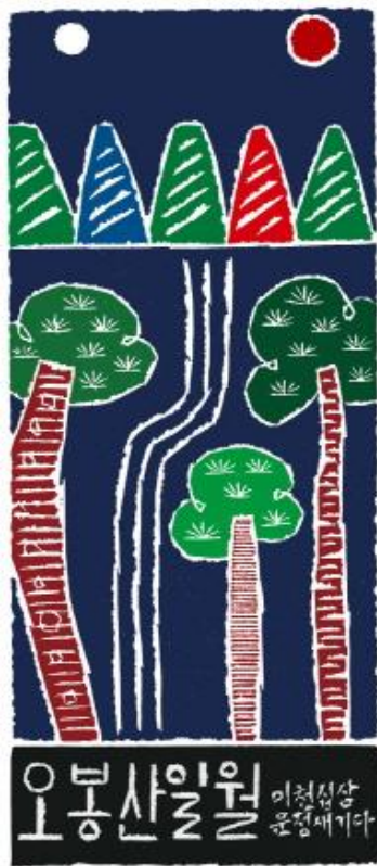
Tae Wan Kim Sun and Moon of Obong Mountain 70x70cm Ink on paper