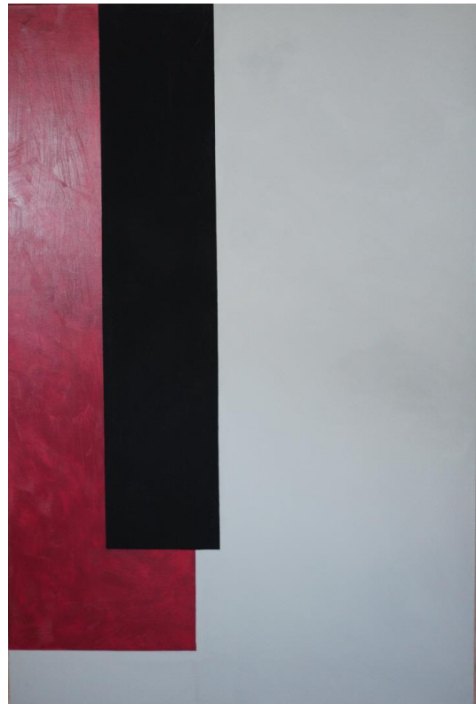
Jim Lesko Still Magenta 60 x 40 inch Acrylic on canvas