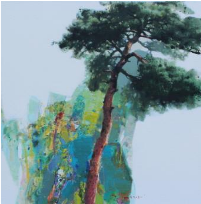
Myeong Ryeol Ryu Pine Tree 45.5 x 45.5 cm Acrylic on Canvas