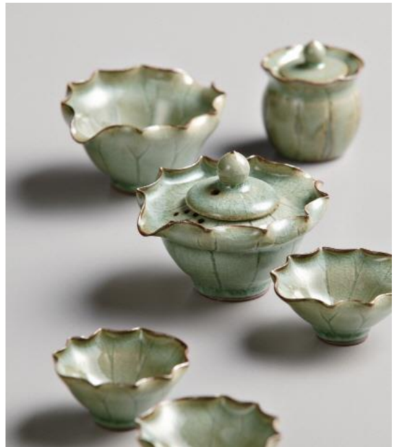
Hyun Choul Shin lotus Leaf Tea Set Yanggu Porcelain