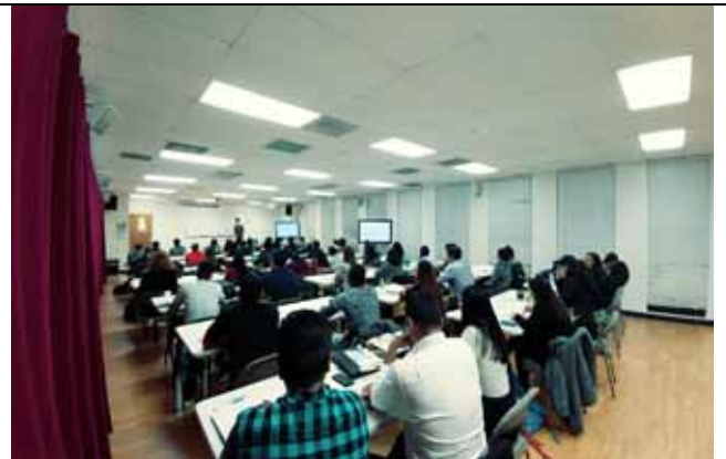
2017 Korean Class

The Second quarter of the Korean Language program will begin on April 18th at the Korean Cultural Center, Los Angeles.