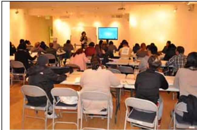
2017 Korean Class