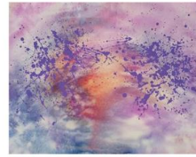
Michelle Oh Touch Series 1610, 22(w) x 29(L) inch