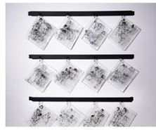
Jinhee Choi Daily Note of Thanks, 18.5 x 24.3cm x 7pcs