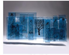
Jinhee Choi The Tree Planted in Heaven, 71.5 x 31.5cm