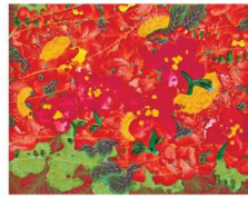
Jinee Ahn The Time of Flowers, 53(w) x 45(L) cm