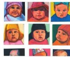
Harriet Zeitlin Zoe, 8(w) x 8(L) inch x 12pcs.