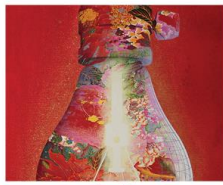
Jinee Ahn The Garden of Light, 97(w) x 162.2(L)cm