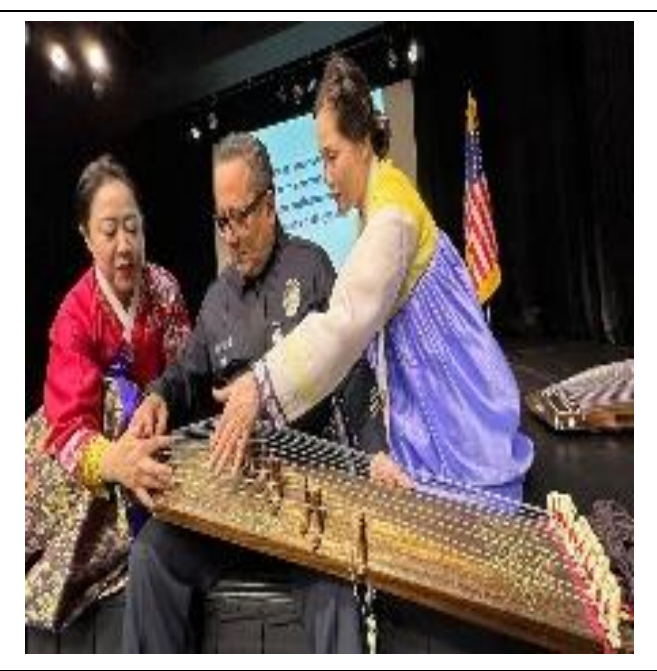
<(Left) 50th LAPD Workshop Web Poster / (Right) 49th LAPD Workshop Reference Photo, February 16. 2023>