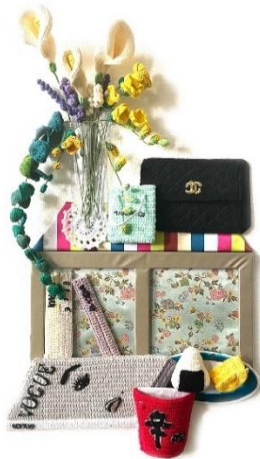
YunKyoung Cho, There Are No Grade of Vanity, 2021

Eunice Choi compares common ceramic vessels to people: The artist feels that there are many commonalities between sculpting and birth; firing and growth. She is known for her expert articulation of natural light, as well as of spaces surrounding common objects such as tea cups, water glasses, and ceramic teapots in a dining room.