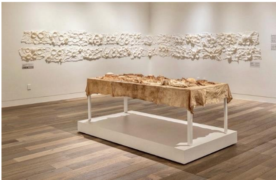
Very Proper Table Settings 2017-2023