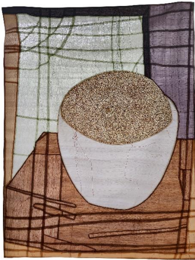
Did You Eat, I Love You!, 2019