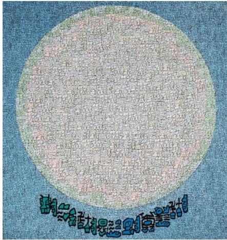
Motherhood Love, 2023