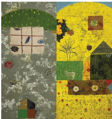
Romance-1803, 40X40 2018