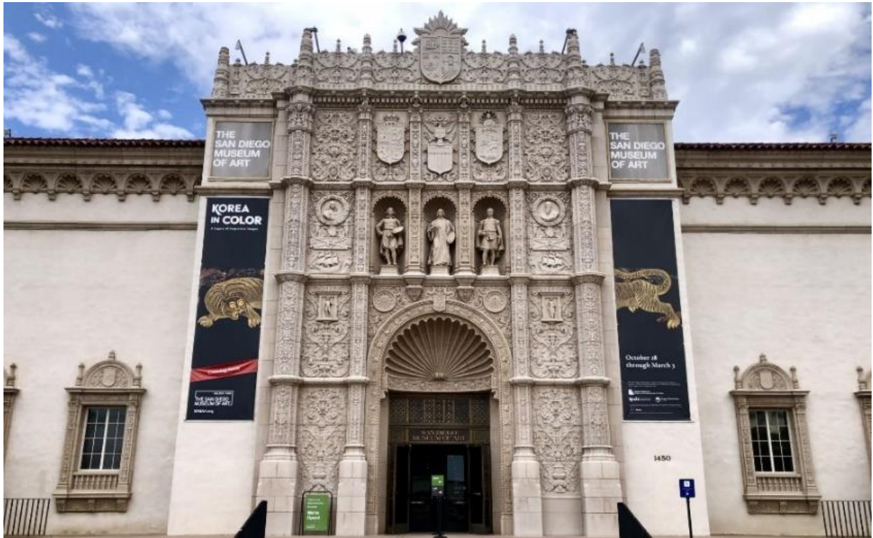
San Diego Museum of Art Facade